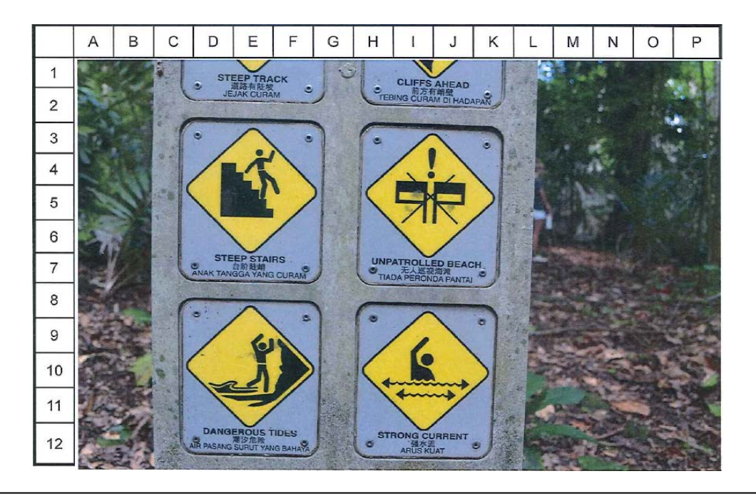
Exhibit 5, Page 7 – Close-up of sign at entrance to Winifred Beach walking track