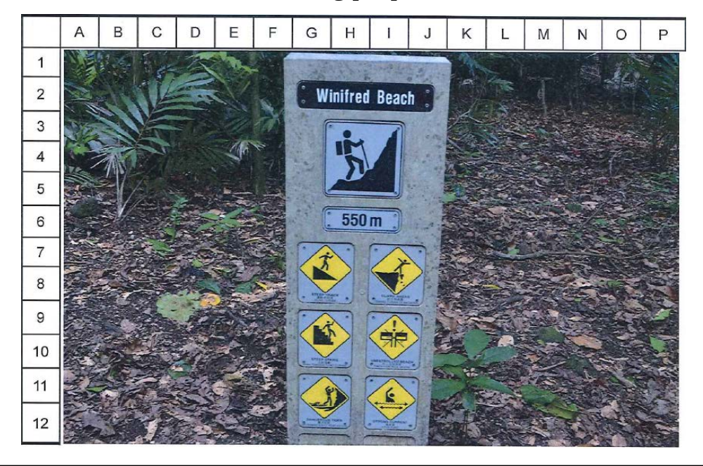
Exhibit 5, Page 6 – Sign at Winifred Beach carpark, at entrance to walking track

35. Signs are erected at the commencement of the marked walking trail to Winifred Beach, and again at the top of the steep aluminium staircase, warning people of the hazards ahead.